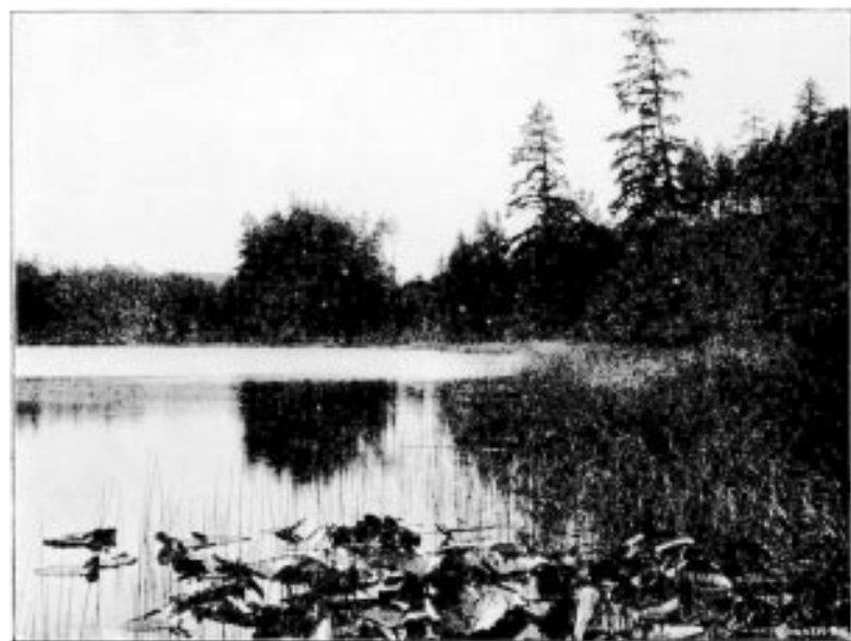
AN ISLAND LAKE.

With September the gun begins to take the place of the rod, and throughout the fall and winter months the rancher may well provide his larder with venison (blacktail deer, carriacus columbianus ), blue and willow grouse, pheasant (introduced), snipe, and a varied assortment of waterfowl. And in the quiet pursuit of game, the hunter will meet with many lovely prospects, of purple hill and placid sea, of a distant jagged ridge of snow-capped mountains, or of some giant peak, cone-shaped, solitary and glittering, above the blue haze of many miles of intervening forest; or, from a tall cliff look down over the