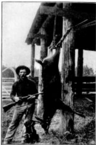
A SALTSRING BUCK.