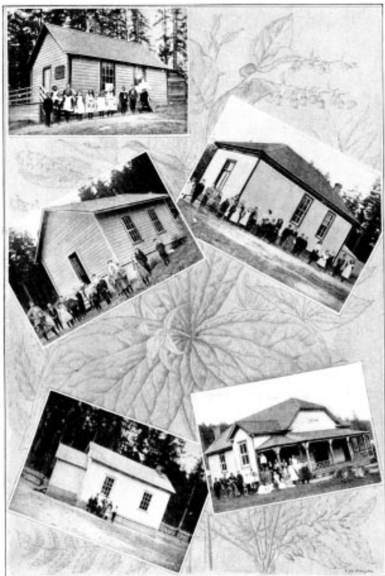
THE SALTSRING ISLAND SCHOOLS.