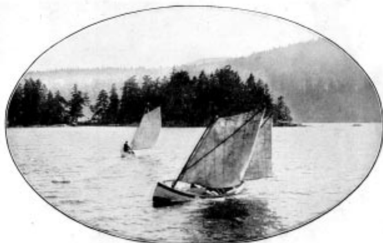
BOATS ON GANGES HARBOUR.

The more adventurous need not, however, confine themselves to home waters, but can visit the neighbouring Vancouver Island, where elk ( cervus canadensis ) can still be found; or in a