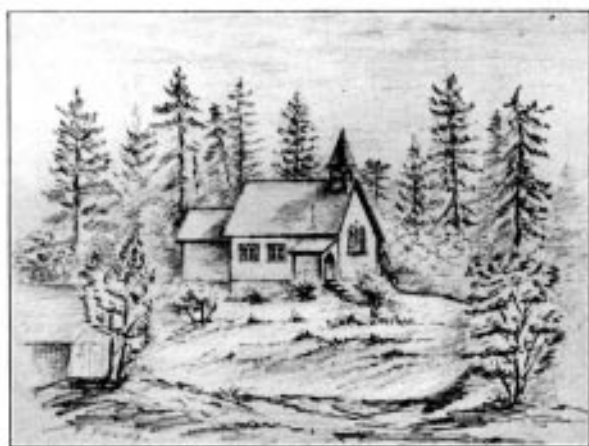
ST. MARK'S, CHURCH OF ENGLAND, VESUVIUS.

Although the Island takes its name from salt springs found near the north end, there is an abundant supply of sweet water , good springs are plentiful and there are eleven lakes.