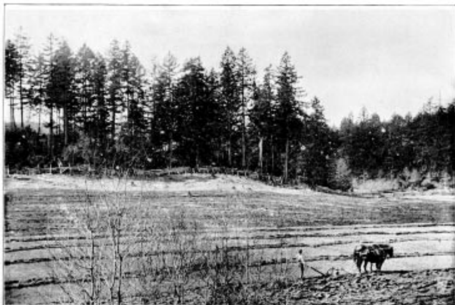
PLOUGHING, SALTSRING ISLAND.