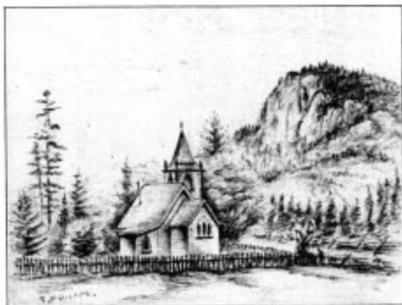
ST. MARY'S, CHURCH OF ENGLAND, SOUTH SALTSRING.

G enerations of Alder and Maple have covered the valleys and bottom lands of Salt Spring Island with a rich, black, leaf mould overlying a clay subsoil, which yields on cultivation heavy crops of hay, grain, and roots . But the higher lands and hill slopes, which nature has clothed chiefly with fir, cedar and balsam, and an undergrowth of the evergreen salal ( gaultheria shallon ) and bracken, have been found by experience to be the best positions for orchards , and here, with a careful choice of aspect almost all kinds of fruit peculiar to temperate climates may be grown. Seen from a distance the island appears densely wooded to the mountain tops, but the timber thins as the elevation increases, giving space for grasses and many evergreen and deciduous shrubs. It is on the rocky, wooded heights that sheep thrive, secure from beasts of prey, sheltered from rain and wind by some thick branching fir, or basking on a ledge of lichen-covered rock. Here they find food the year round, but the careful shepherd will provide a box of salt and a rack of sweet hay in winter to which the sheep will come when snow threatens or feed is scarce.