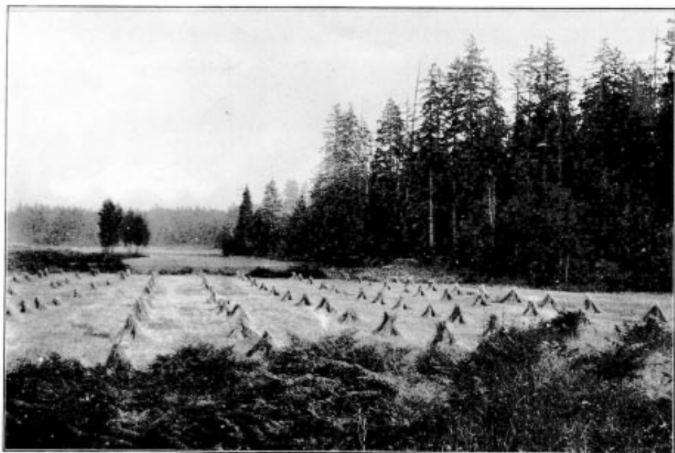
A CROP OF OATS, SALTSRING ISLAND.