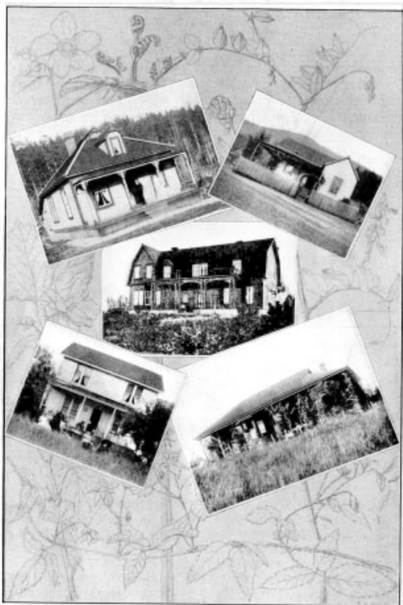
SOME SALTSRING ISLAND HOMES.