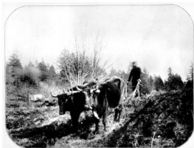
THE OLD STYLE.

The chief exports besides agricultural products are pit props, cordwood, charcoal, and sandstone.